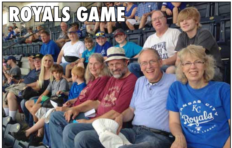
This group of Mount Ayr Restoration Branch rooters cheered on the Royals in a game in Kansas City September 27. See News and Notes.