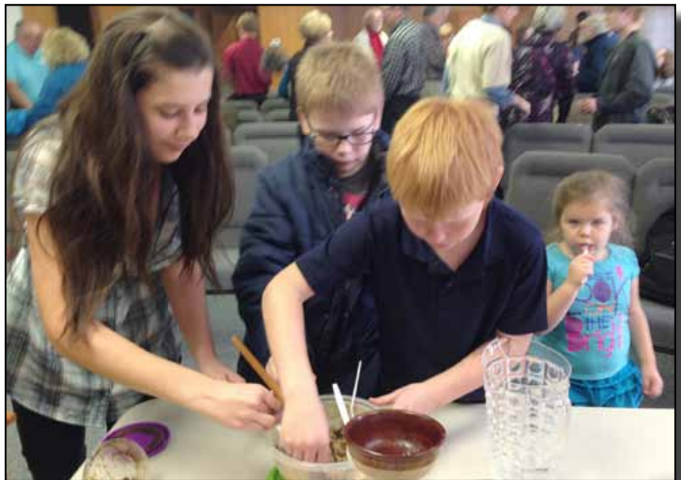
Cookie dough is tasted following the service to prove that following the recipe yields the greatest reward.

Sin is an archery term that means not or without. An good archer would