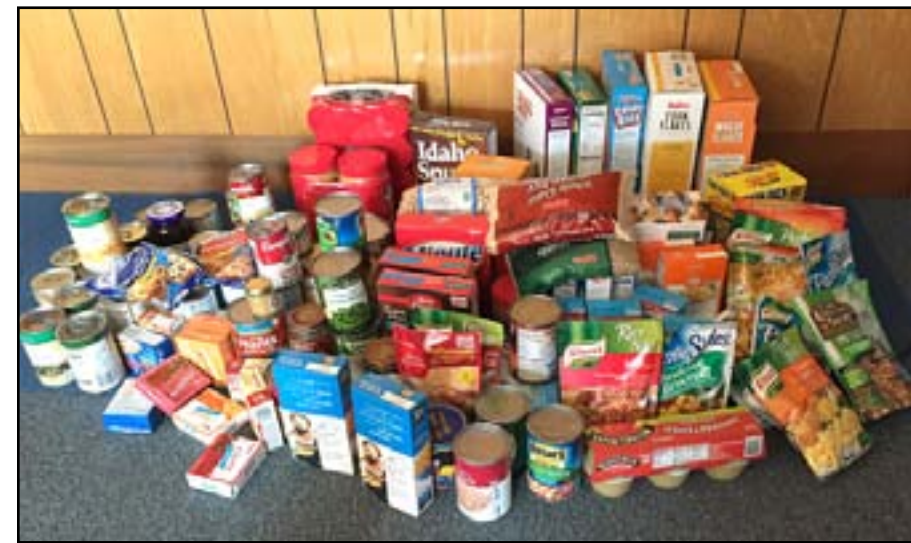
A total of 151 food, health and paper good items were collected to take to the Mount Ayr MATURA Neighborhood Center in the month of February, tripling our January total. The branch is using the third Sunday of the month to collect the items that help the hungry in the area with needs.