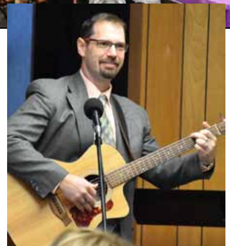
Some 63 people took part in the breakfast that started the day and 75 attended the morning worship.